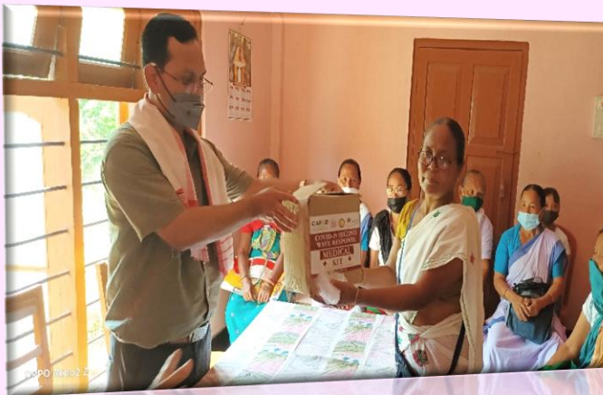
St. Francis of Assisi Parish, Mariampur 31 st October 2021 200 Health Workers - Medical Kits