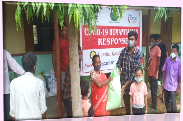
St. Vincent De Paul Parish, Derapathar 20 th & 21 st July 2021 767 Families – Food Kits