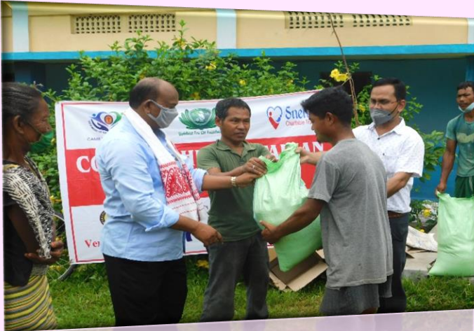
St. Thomas Parish, Kaki 19 th July 2021 367 Families – Food Kits