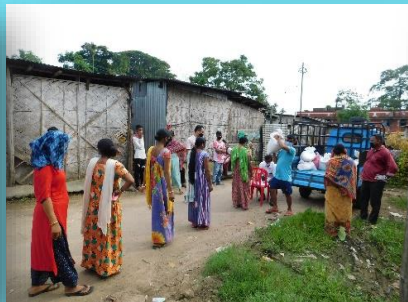
Kusal Nagar Nizarapur